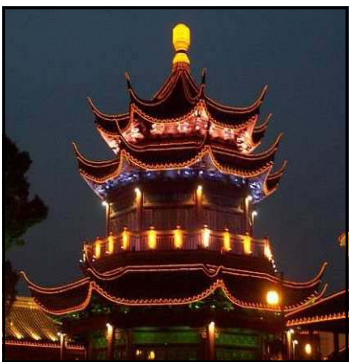
The Temple of Heaven in Beijing.