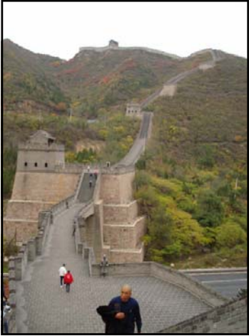
The Great Wall in Beijing.

“The trip to China was AMAZING. (The trip) all flowed beautifully thanks to your staff. You all did a GREAT job.”