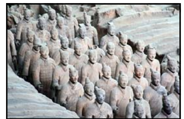
The Terracotta Warriors in Xi'an.