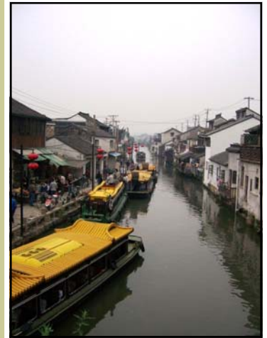
The "Venice of China" in Suzhou.

Optional tours are also available for additional fees. Included in these tours is a trip to Xi'an, the site of the renowned Terracotta Warriors for an additional fee of $450 per person. This particular optional tour will be available ONLY to travelers departing on the March 12, 2010 trip. For more details, please call the Exeter Area Chamber of Commerce.